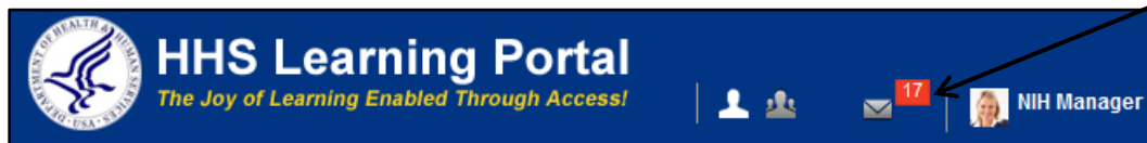
Figure 1 – Inbox icon