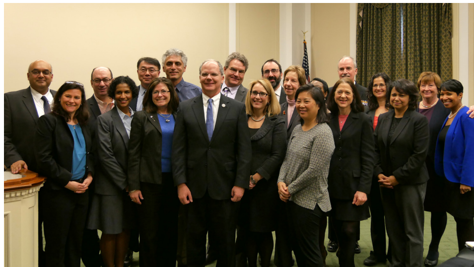
ExLP participants, faculty and staff with Representative Brett Gurthrie (R-KY).

On March 3, NIH Executive Leadership Program (ExLP) participants visited Capitol Hill to engage with members of Congress, congressional staff and policy-makers. This was a great opportunity for participants, particularly for NIH leaders whose roles don't typically involve significant contact and interactions with the legislature. Representatives Don Beyer (D-VA), Brett Gurthrie (R-KY), and a host of policy experts offered insights on leadership, the current climate, budget and policy.