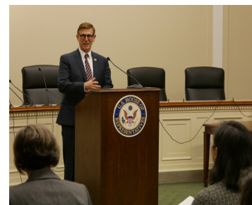
Representative Don Beyer (D-VA)